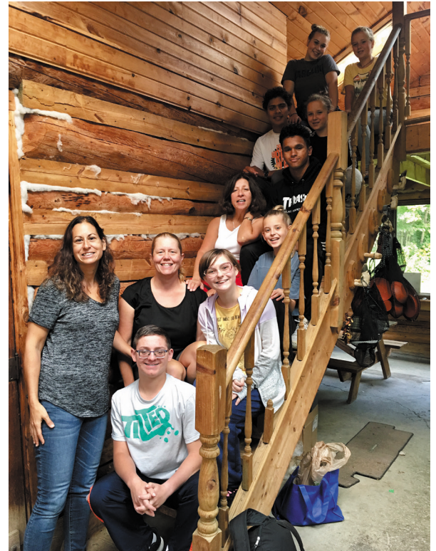
Round-Top Retreat: FBC Youth gathered for a rustic team-building retreat in Richford where they discovered the joys of not having Internet connection or running water.

Our final challenge of the weekend was to work together in pairs to participate in an egg drop to illustrate that we are stronger when we put our ideas together. It was a great time of coming together to enjoy good food, great discussions and lots of laughs.