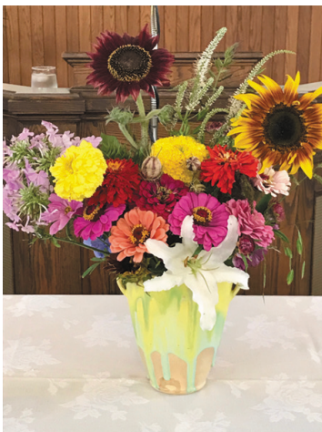
Communion Table Flow bouquet, Aug. 18th