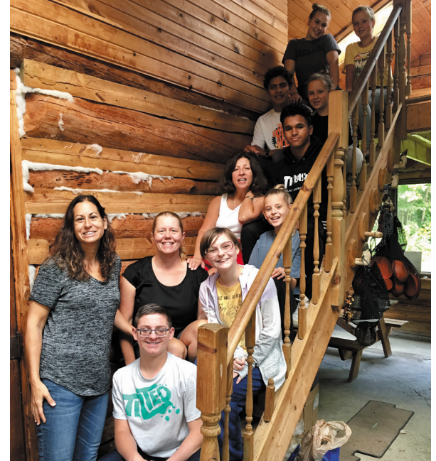
Round-Top Retreat: FBC Youth gathered for a rustic team-building retreat in Richford where they discovered the joys of not having Internet connection or running water.