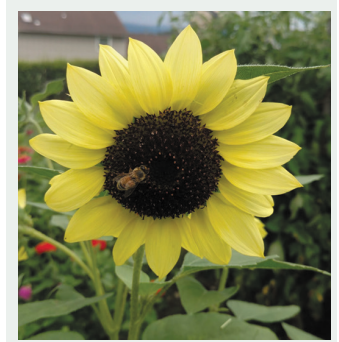
Pollinator bee on sunflower

So I say to you, walk with the wind and let the spirit of peace and everlasting love be your quide.