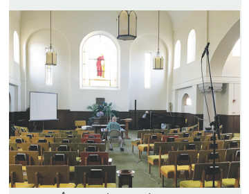
An empty sanctuary