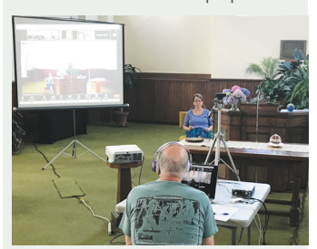
All ready for Zoom worship