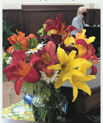
Flowers next to the pulpit.