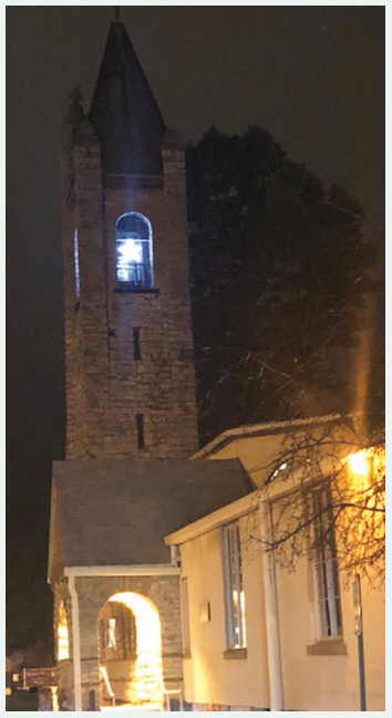
First Baptist Church in 2020