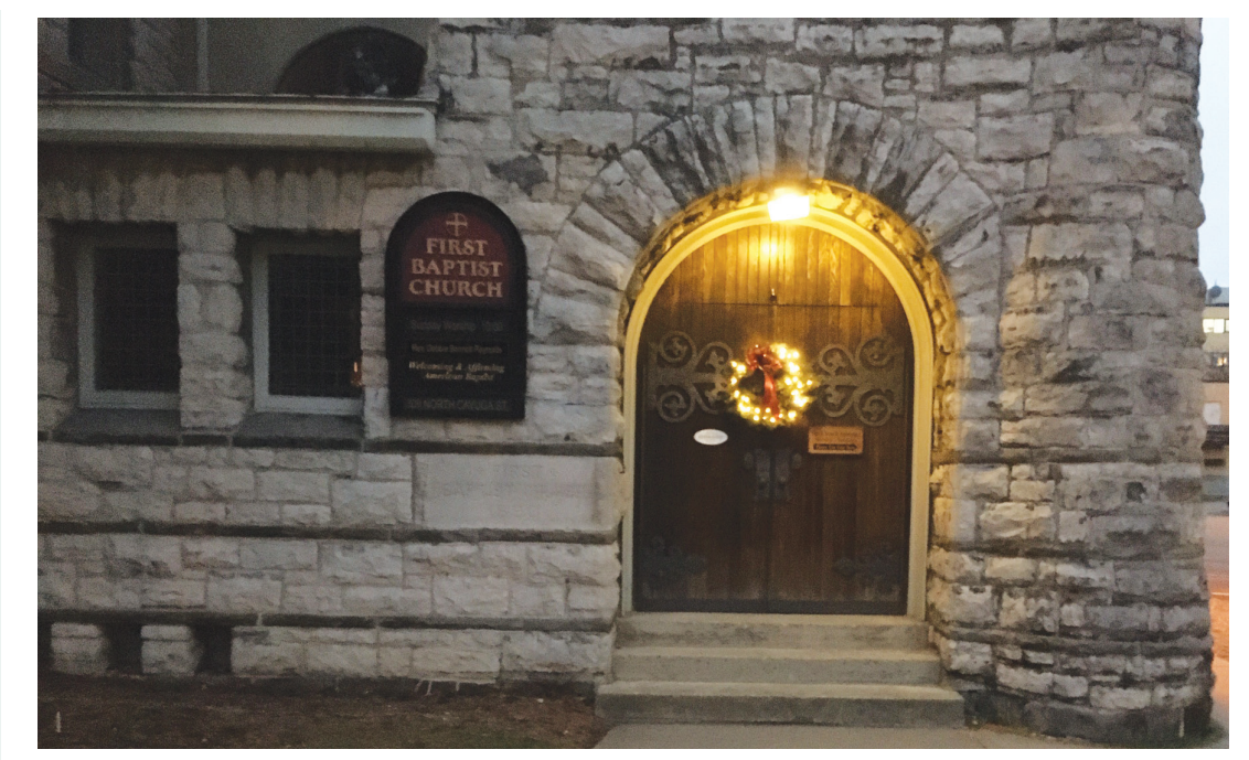
FIRST BAPTIST WELCOMES ALL: Even during the dark days of this 2020 COVID-19 pandemic, the wreaths on First Baptist's doors welcome all. Our three wreaths will be lit each evening from 4:45-9:45 pm.

In the Baptist tradition each of us are called to be ministers. Therefore, each of you is invited and urged to contribute to our Visitor . Please send announcements, articles, features, pictures to: susan.eymann@transonic. com