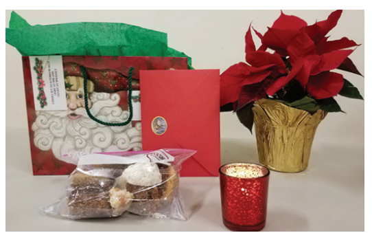
Advent/Christmas gift packages assembled by the Hospitality Ministry team for delivery to 19 of our seniors.