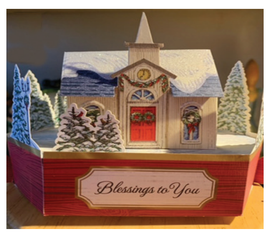
This lovely pop-up Christmas card will accompany the gift packages delivered to members of our congregation.

First Baptist Church in Ithaca is a nurturing and inclusive community. Guided by Jesus' Teachings, we strive for Social & Ecological Justice; and embrace the Baptist tradition of Bible, Soul, Church and Religious Freedoms.