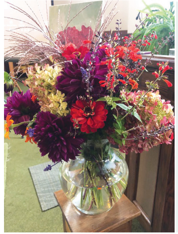
October 17th

Spectacular can only describe the breathtaking bouquets that our Flower Committee graces our sanctuary with each week.