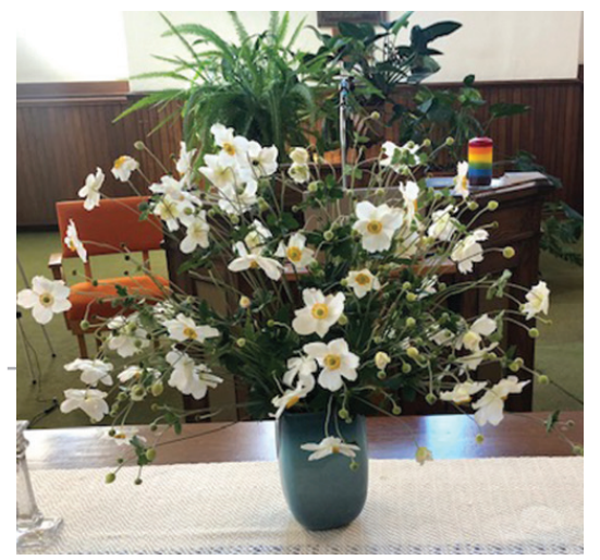
September 26th