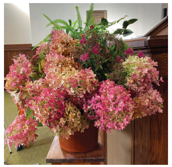
October 24th