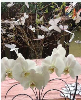
White orchids and butterflies, representing the many "saints" of FBC.