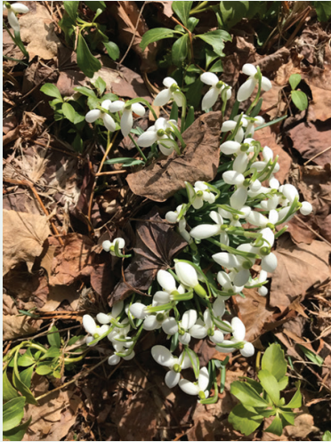
SPRING IS HERE! Snow drops are filling our front yard.