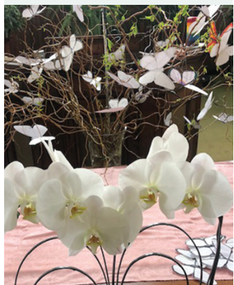
White orchids and butterflies, representing the many "saints" of FBC.