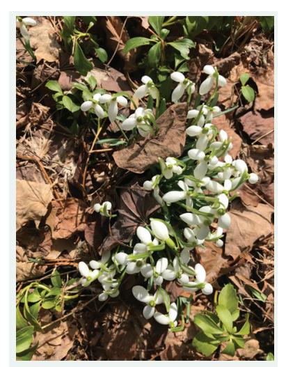
SPRING IS HERE! Snow drops are filling our front yard.