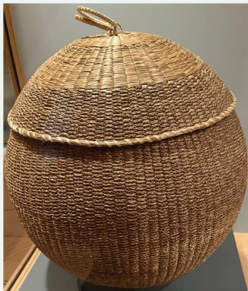
Sweet-grass and black ash basket by Wolf Clan Mohawk Indian entitled Hair of Mother Earth 1997 exhibited at the Cooperstown James Fenimore Museum. Basket is representative of baskets created by the Haudenosaune Indians.