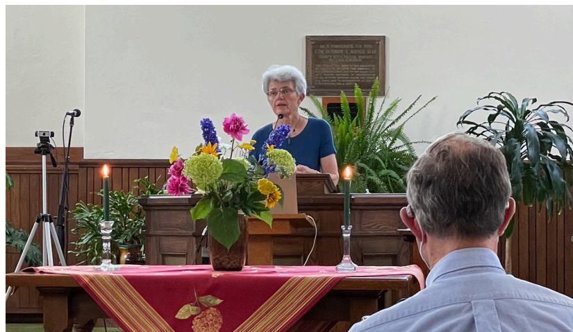
Debbie Allen preaching in June

From Life's Mysteries Unveiled pp. 80-81