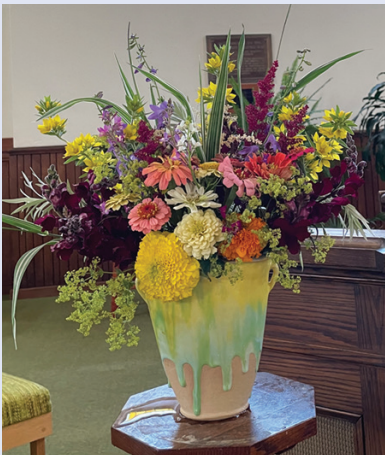
Communion table bouquet July 3rd