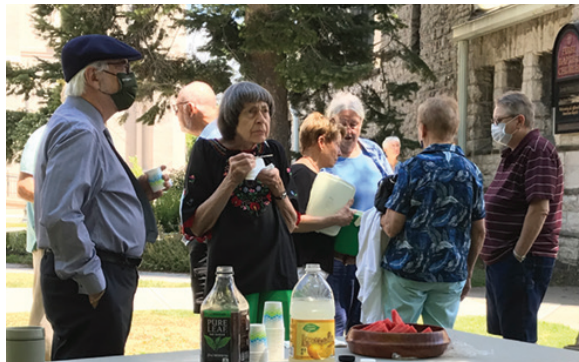
Refreshments and discussion