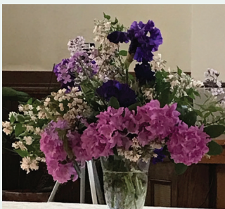
May Communion Table Bouquet