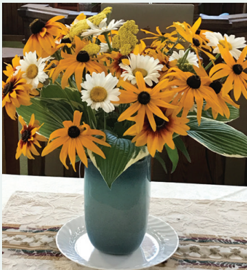
Communion table bouquet July 10th