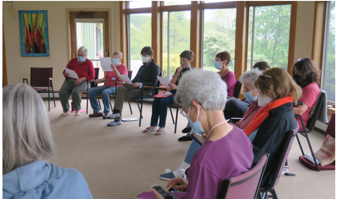
The annual FBC Women's Retreat was held over Memorial Day weekend at Light on the Hill in Van Etten.