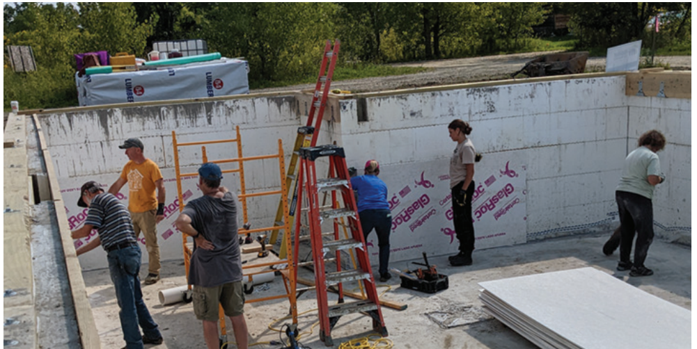
FBC adult volunteers work on wall boarding a basement of a new Habit of Humanity home.

The danger in this kind of thank you is that someone's name has been left off. If I have done so, I deeply apologize. Each and every person who attends First Baptist brings their own special gift, and I am grateful for everyone in this.