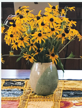
August 7th Bouquet