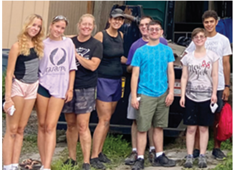
First Baptist Church Youth Group