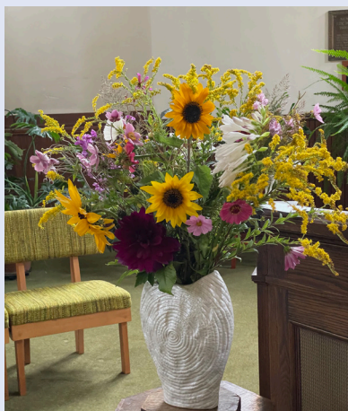
Communion table bouquet Sept 12th

Nov. 12-13: All-Church Retreat at Camp Casawasco