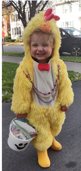
Cute as a chick

The November 1st issue is on the new, frightening dangers for the medical profession, its patients, the curtailing of on-hands OBGYN education, and the threat of losing medical licenses. Those most at risk to suffer lack of care or death were again the poor and non-white, especially in rural areas. This issue can also be studied by typing into Google "The AMA and Roe v. Wade" This is a truly major catastrophe. Unexpected by most since Roe v. Wade is so well accepted by 61% of Americans, it obviously raises political issues (such as Supreme Court appointees lied at confirmation hearings) as well as the age-old domination of men in power dictating what happens to their women folks. As the father of three, I am proud of my wife and our three children but watching her through the total 27 months of pregnancy made me glad my part was so easy, and wishing there were more women serving as Supreme Court Judges, fanatic Red State lawmakers and citizens now wanting to ban abortion pills and even birth control. Turning back our clock one hour is fine; turning back our country a century is not.