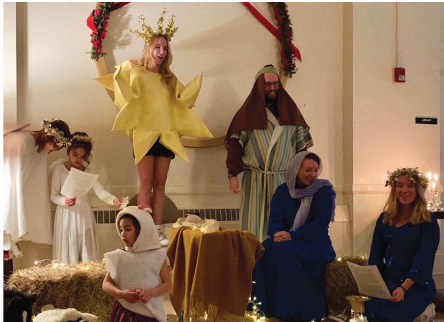
Nativity in the Community Room on Christmas Eve: Frigid temperatures moved the scheduled Christmas Eve outdoor caroling and live nativity before the Christmaas Eve service into the Community Room at FBC.