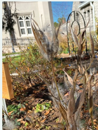
Pollinator Garden November 6th