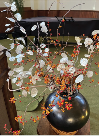
Bittersweet & Money Plant