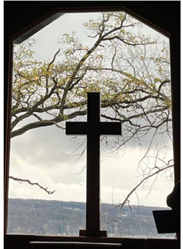
Chapel at Casowasco