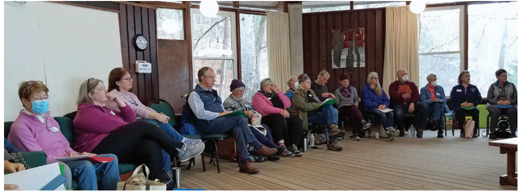
Group gathered for instructions before break-out opportunities.

This prayer was derived from the Mohawk version of the Haudenosaunee Thanksgiving Address published in 1993 and provided courtesy of the Six Nations Indian Museum and the Tracking Project.