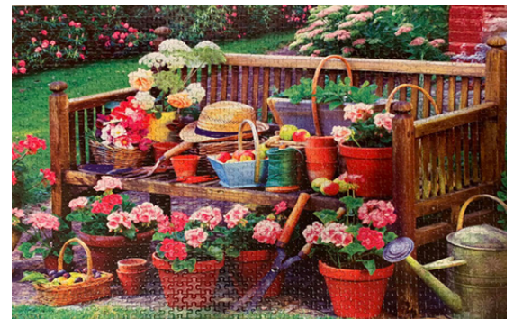
1000 piece puzzle begun at the retreat and completed by Margie Latham in Vermont.