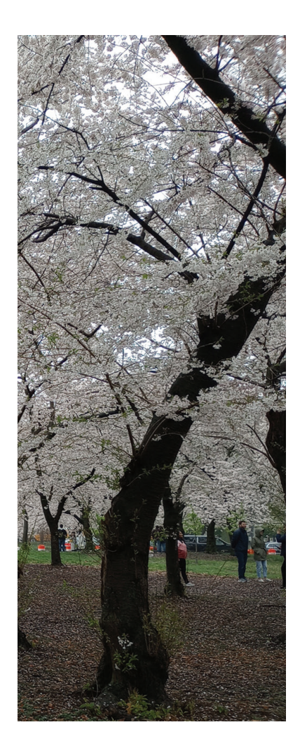
Cherry Blossoms: Washington, D.C.