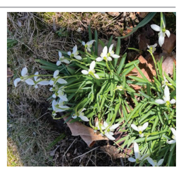
Snow drops

There is no time like Spring, Like Spring that passes by; There is no life like Spring-life born to die, – Piercing the sod, Clothing the uncouth clod, Hatched in the nest, Fledged on the windy bough, Strong on the wing: There is no time like Spring that passes by, Now newly born, and now Hastening to die.