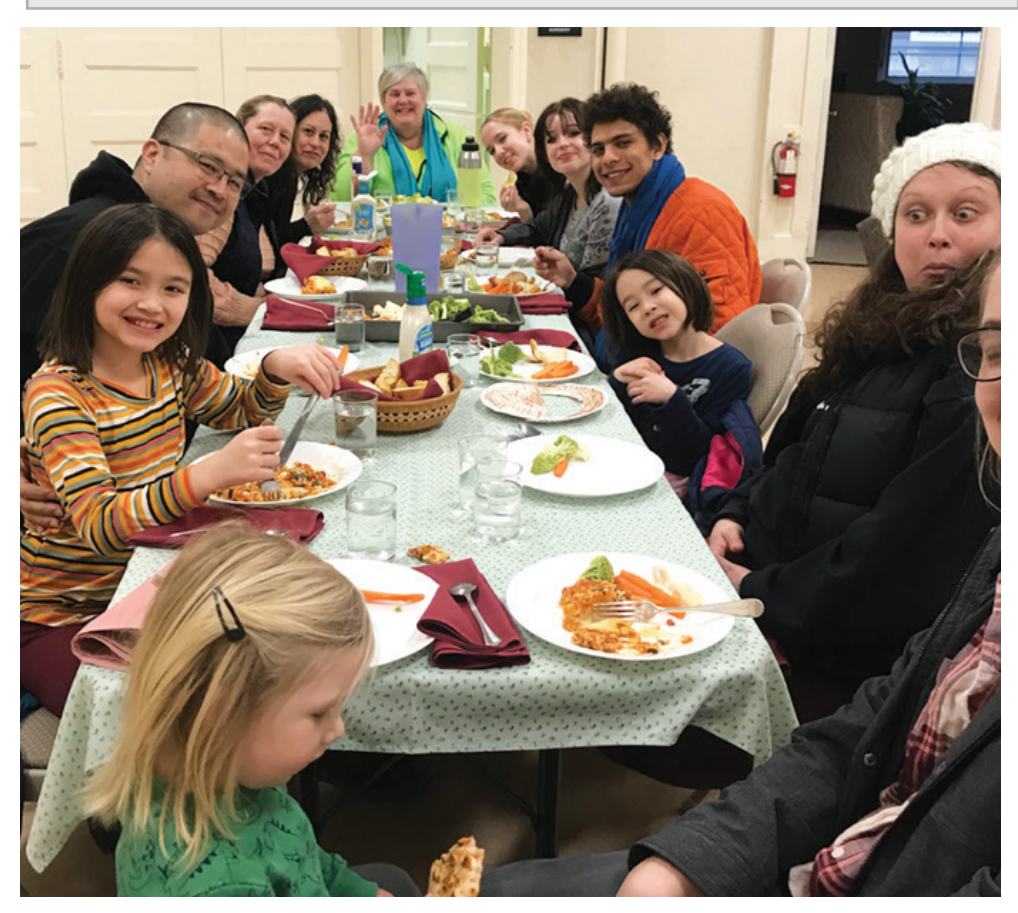
Messy Church: In March FBC children and youth were invited to participate in "Messy Church," a creative endeavor for children to participate in fun activities at church. It was a lot of fun. There are plans in the works for an "Messy Church" event once a month with fun, food and games..