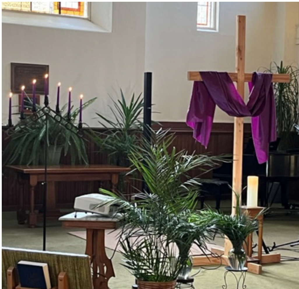
Candle extinguished after each reading until the sanctuary is in total darkness depicting the darkness of the crucifixion