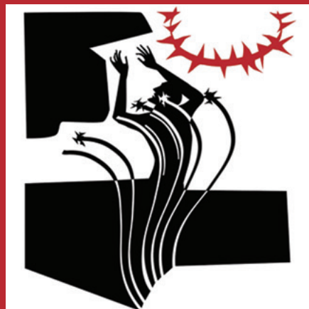
6. Jesus is Scourged and Crowned with Thorns