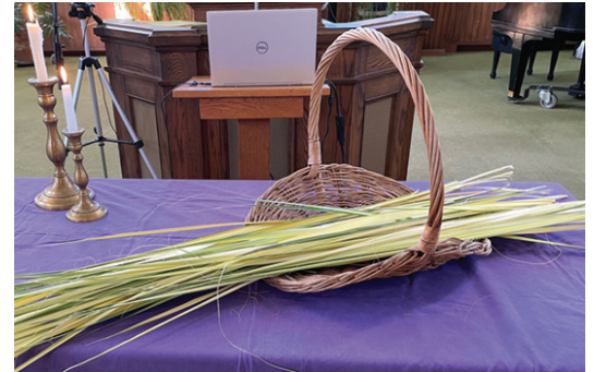
Palms distributed by children to parishioners at beginning of the Palm Sunday worship service.

Jesus's Triumphal Entry into Jerusalem When they had come near Jerusalem and had reached Bethphage, at the Mount of Olives, Jesus sent two disciples, saying to them, "Go into the village ahead of you, and immediately you will find a donkey tied and a colt with her; untie them and bring them to me. If anyone says anything to you, just say this, 'The Lord needs them.' And he will send them immediately." This took place to fulfill what had been spoken through the prophet: "Tell the daughter of Zion, Look, your king is coming to you, humble and mounted on a donkey, and on a colt, the foal of a donkey." The disciples went and did as Jesus had directed them; they brought the donkey and the colt and put their cloaks on them, and he sat on them. A very large crowd spread their cloaks on the road, and others cut branches from the trees and spread them on the road. The crowds that went ahead of him and that followed were shouting, Hosanna! Hosanna! Blessed is the One who comes in the name of the Lord!