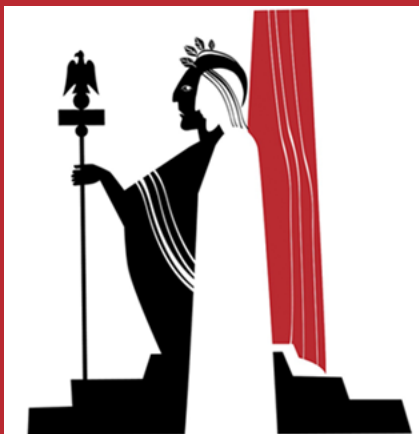
5. Jesus is Judged by Pilate