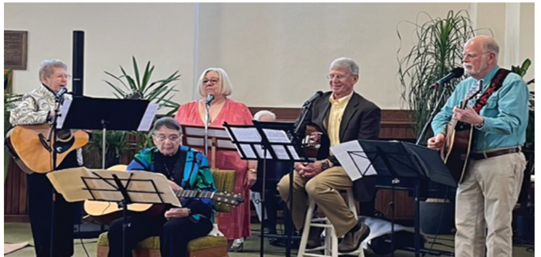
New Creation Singers