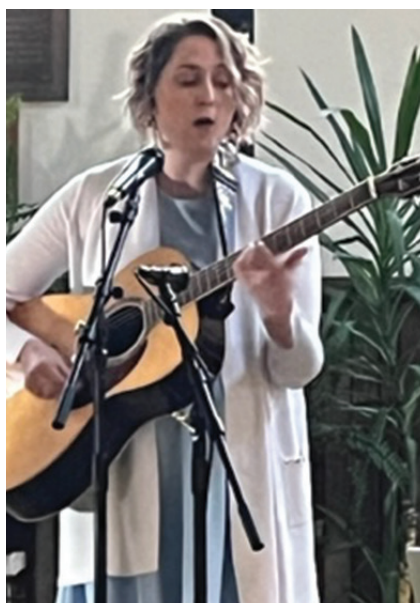
"Make Me New"