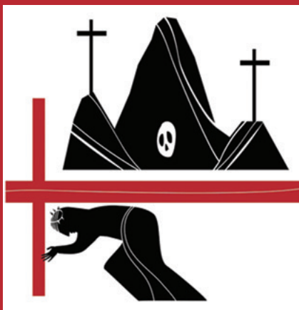
7. Jesus Bears the Cross