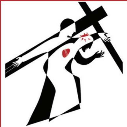
8. Jesus is Helped by Simon to Carry the Cross