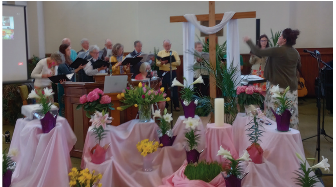
FBC Choir Sings Handel's "Alleluia Chorus" on Easter Sunday