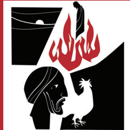
4. Jesus is Denied by Peter