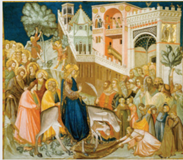
Entry of Jesus Christ into Jerusalem (1320) by Pietro Lorenzetti: entering the city on a donkey symbolizes arrival in peace rather than as a war-waging king arriving on a horse. Its name originates from the palm branches waved by the crowd to greet and honor Jesus as he entered the city.

Palm Sunday is the Christian feast that falls on the Sunday before Easter. The feast commemorates Christ's triumphal entry into Jerusalem, an event mentioned in each of the four canonical Gospels. Its name originates from the palm branches waved by the crowd to greet and honor Jesus as he entered the city.