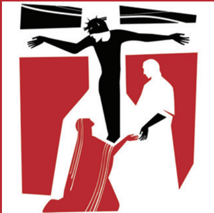
11. Jesus Promises His Kingdom to the Good Thief 12. Jesus Dies on the Cross