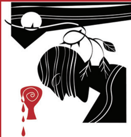
1. Jesus in the Garden of Gethsemane

6. Jesus is Scourged and Crowned with Thorns John 19:1-3 1 Then Pilate took Jesus and had him flogged. 2 And the soldiers wove a crown of thorns and put it on his head, and they dressed him in a purple robe. 3 They kept coming up to him, saying, "Hail, King of the Jews!" and striking him on the face.