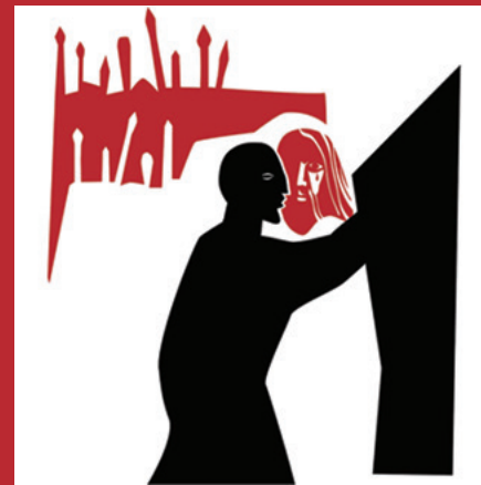
2. Jesus is Betrayed by Judas and Arrested