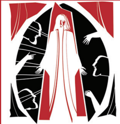
3. Jesus is Condemned by the Sanhedrin