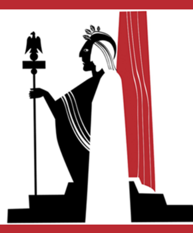
5. Jesus is Judged by Pilate