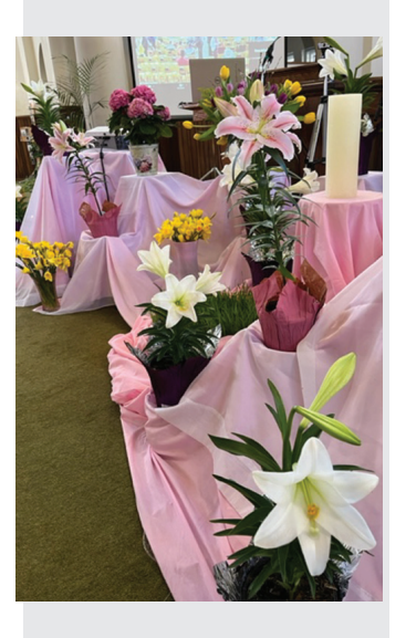
What does the Lord require of you? To do justice, love mercy, and walk humbly with your God. Micah 6:8