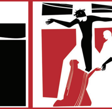
11. Jesus Promises His Kingdom to the Good Thief 12. Jesus Dies on the Cross