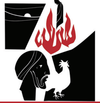
4. Jesus is Denied by Peter

2. Jesus is Betrayed by Judas and Arrested