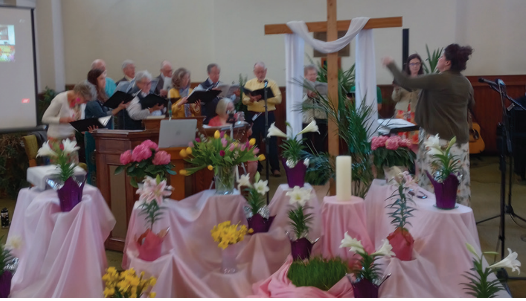
FBC Choir Sings Handel's "Alleluia Chorus" on Easter Sunday

First Baptist Church in Ithaca is a nurturing and inclusive community. Guided by Jesus' Teachings, we strive for Social & Ecological Justice and embrace the Baptist tradition of Bible, Soul, Church and Religious Freedoms.