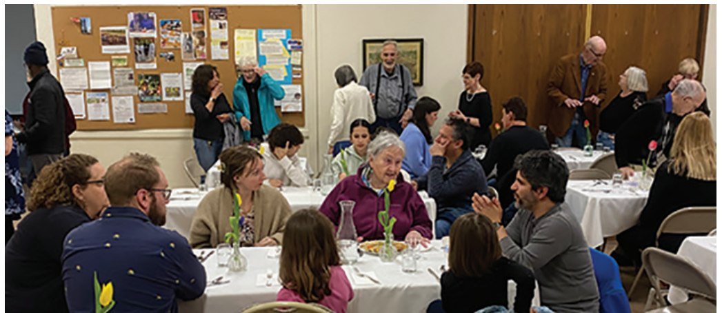
Fellowship abounded at West African fundraiser dinner April 27th.