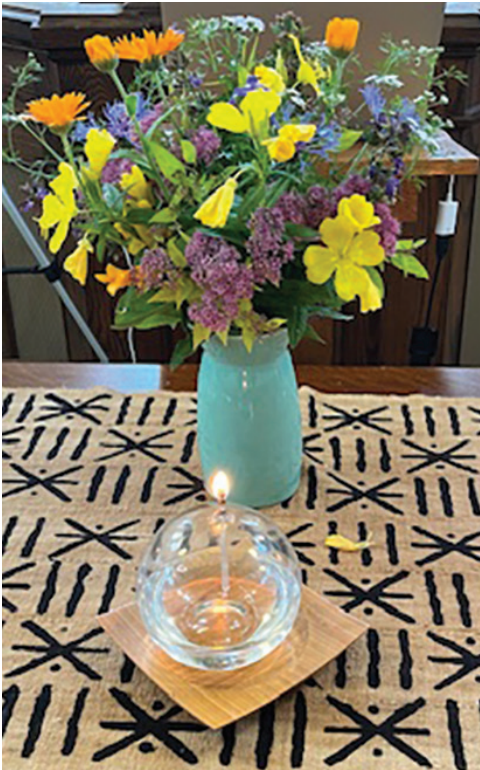
May 16th Communion Table Bouquet

First Baptist Church in Ithaca is a nurturing and inclusive community. Guided by Jesus' Teachings, we strive for Social & Ecological Justice and embrace the Baptist tradition of Bible, Soul, Church and Religious Freedoms.