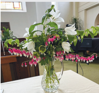
May 12th flowers