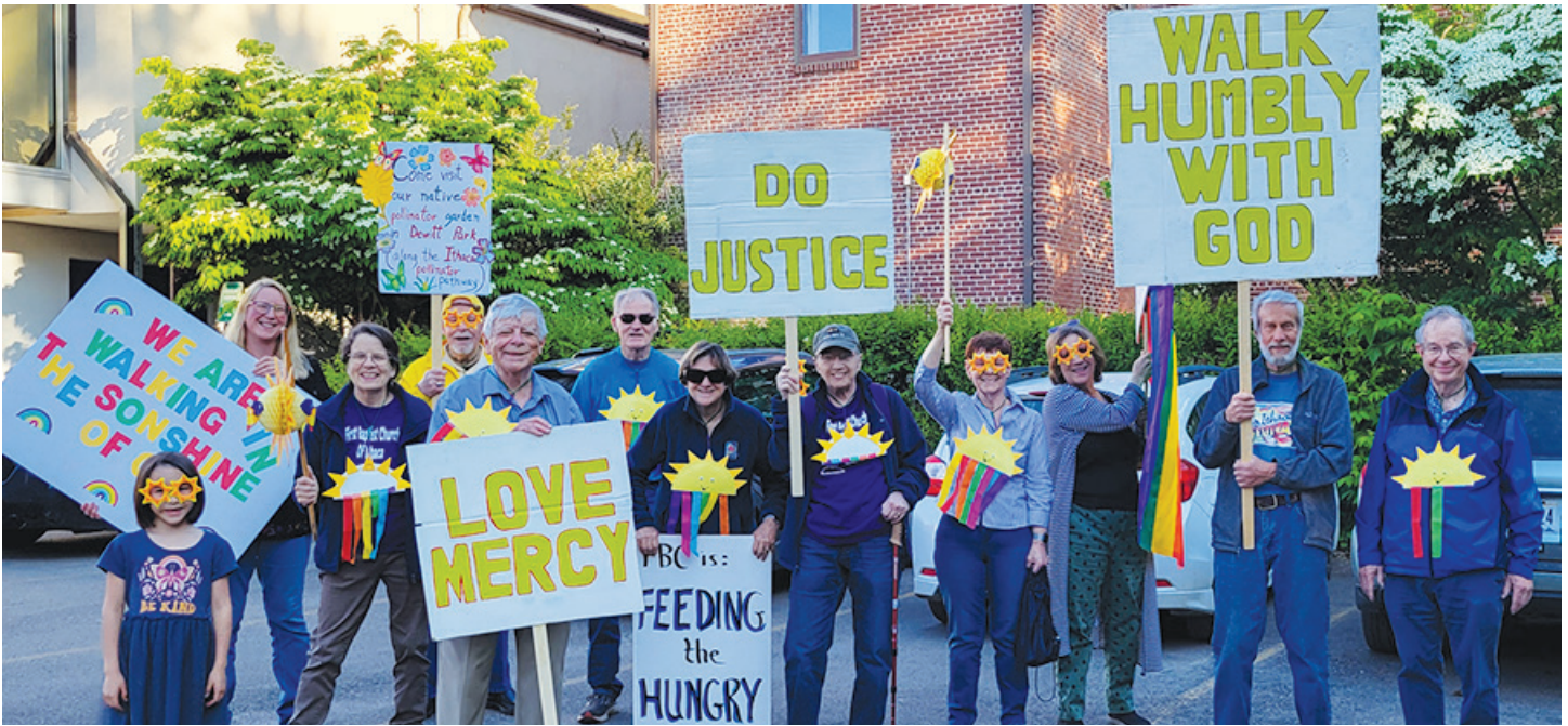
First Baptist Church marchers in the annual Ithaca Festival Parade