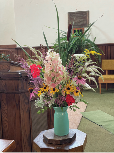
Tina Hilsdorf 's July 12th Communion Table Bouquet