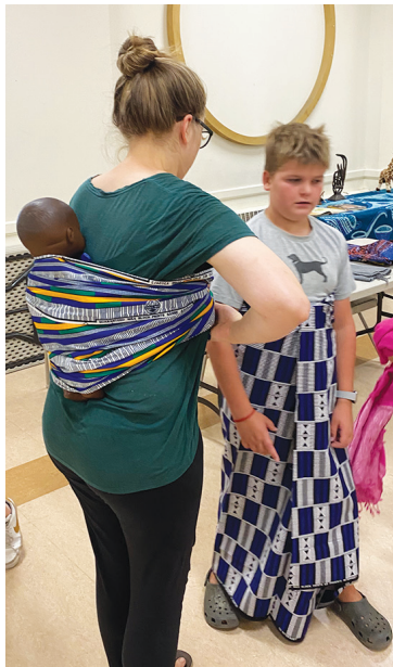
On Day 3, campers learned about FBC's connection to West Africa including how to hold babies on their backs and make fried bananas.