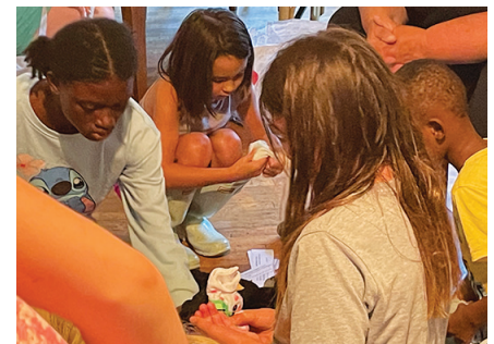
Intent campers make crafts at the Catholic Workers House on Day 2 of FBC Peace Camp.