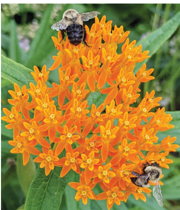
Bees on Butterfly Weed in FBC's Pollinator Garden