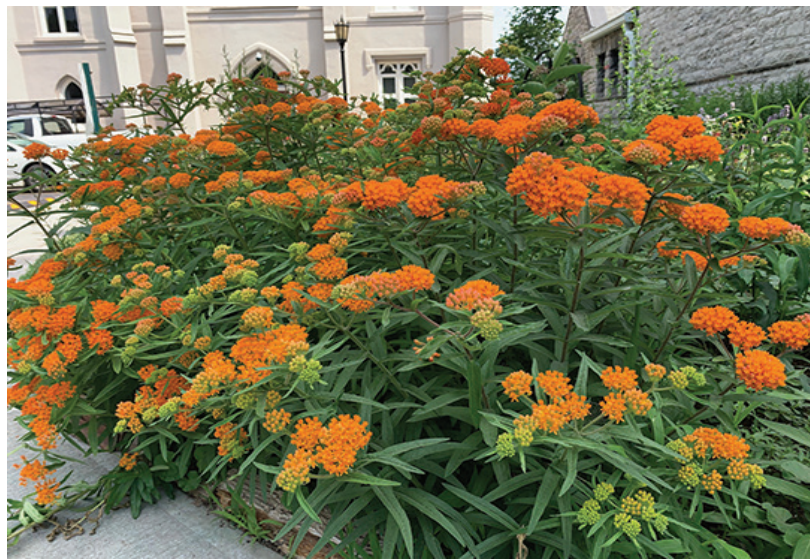
Butterfly weed abounds in pollinator garden