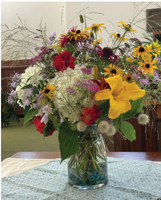
Communion Table Bouquet