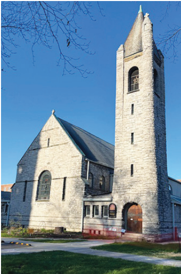
First Baptist Church in Ithaca