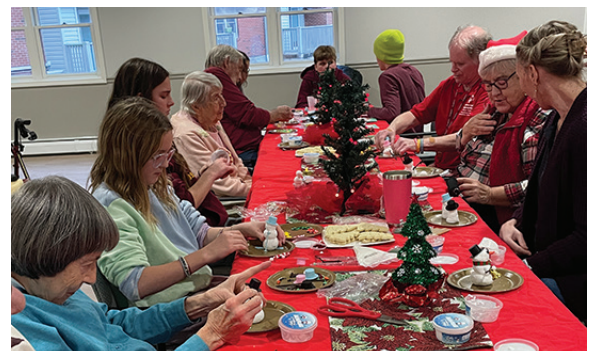
A table of residents and visitors enjoy goodies at Longview multi-generational Christmas party.