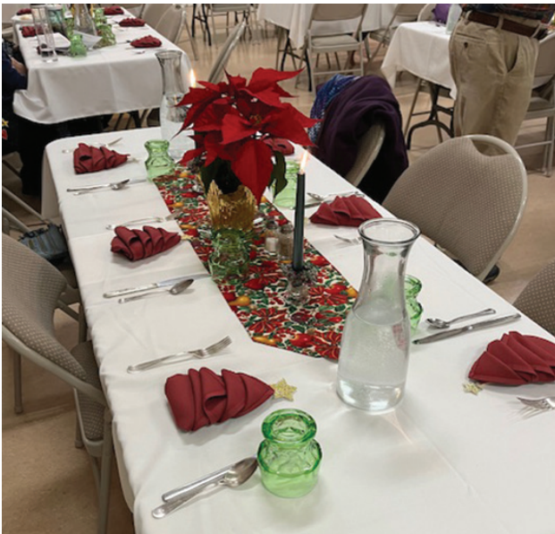
Table settings that take your breath away!