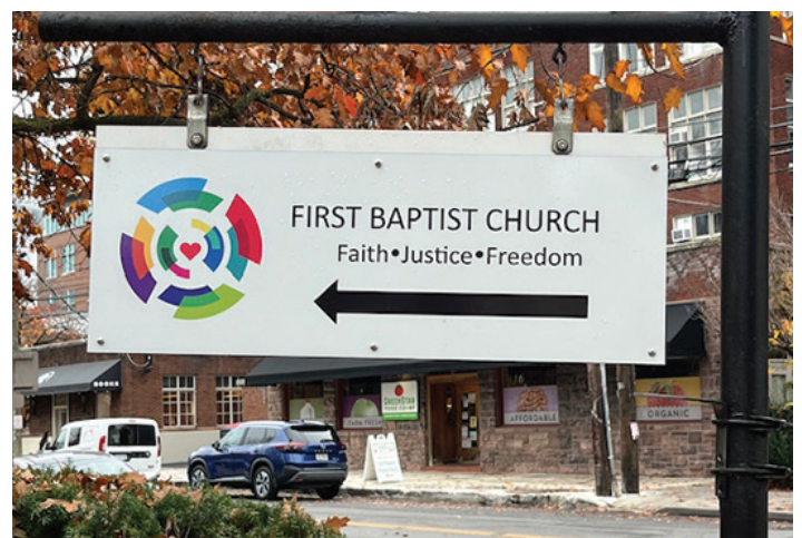
New FBC sign at corner of Cayuga and Buffalo streets.