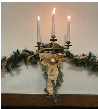
Gas lamps in sanctuary were lit for the Christmas Eve service.