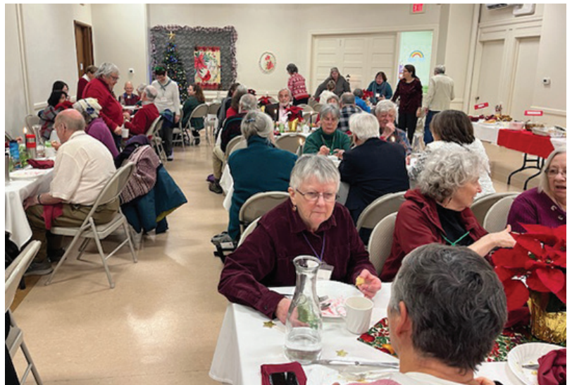
Conversations accompanied delicious food.