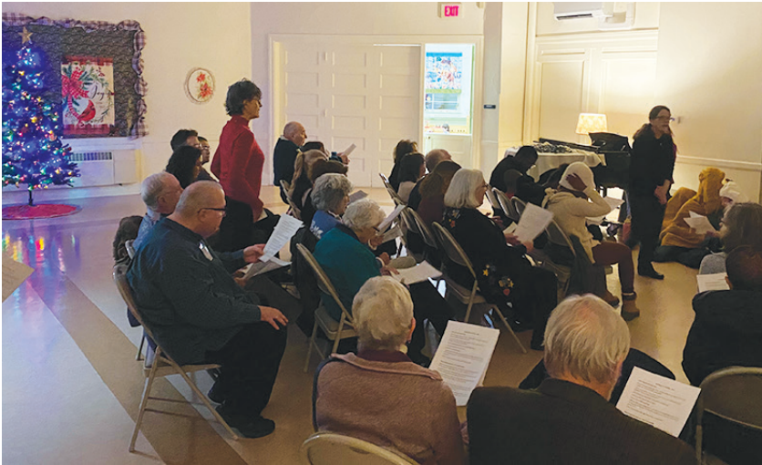
Early on Christmas Eve, the Community Room was filled to view a live nativity (picture on last page) and to sing carols before the 7 pm traditional Christmas Eve worship service.