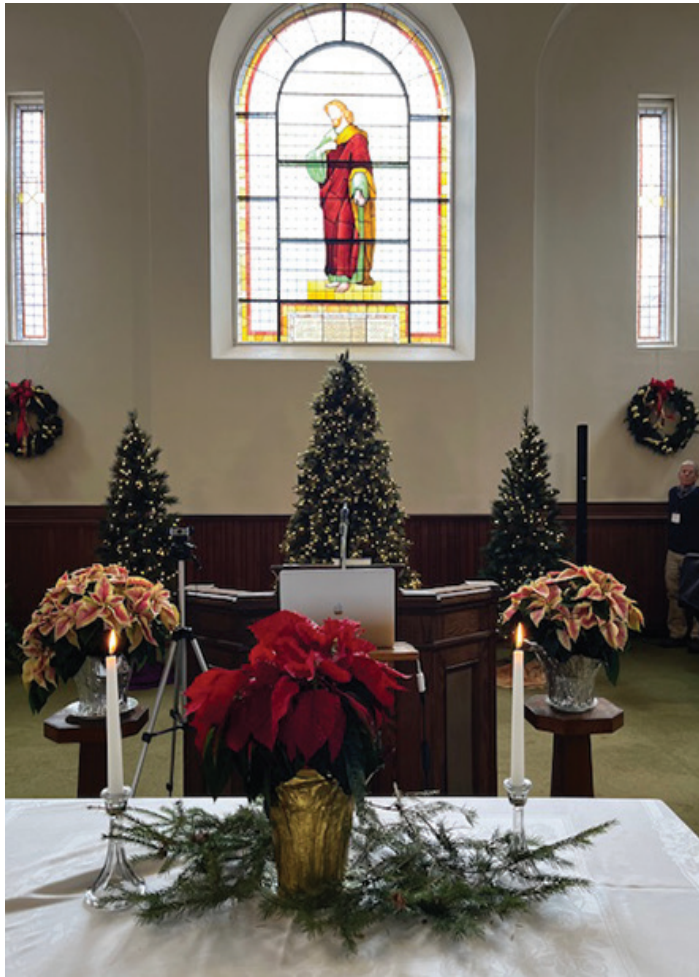
Christmas trees, wreaths, poinsettias and swags transformed First Baptist's sanctuary into Christmas wonder.