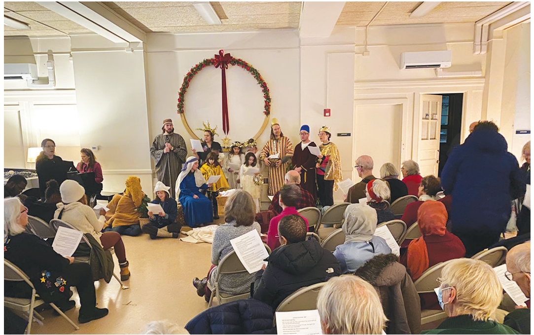
Before the 7 pm Christmas Eve worship service, folks gathered in the Community Room for singing of favorite carols, against a tableau of a live nativity complete with camel on the left.