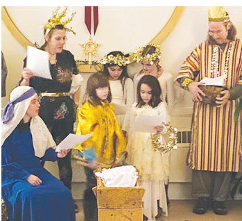
See page 8.

What does the Lord require of you? To do justice, love mercy, and walk humbly with your God. Micah 6:8