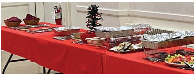
A sumptuous feast awaits.